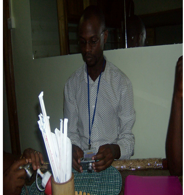
Given during a workshop at Maseno hotel