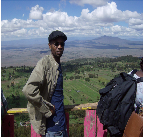
Given at the Great Rift Valley perfect view point